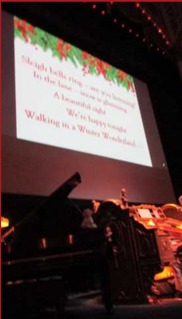
The larger than life lyrics for all to sing