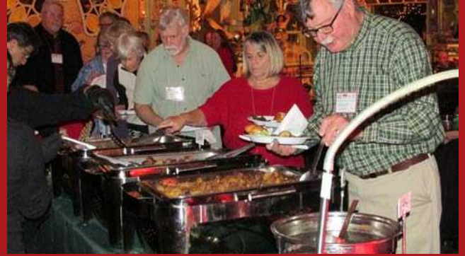
Making serious decisions in the buffet line