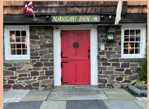
Nassau Inn 10 Palmer Square Princeton, NJ 08542

Scan the codes below using your phone's camera.