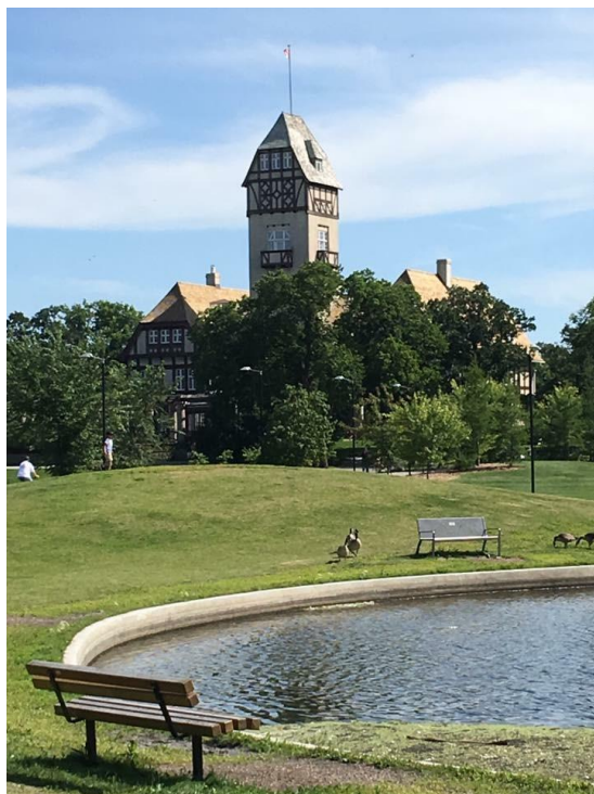
Pavillion Assinboine Park

We start today's adventures with a "Journey to Churchill" to see the what is probably the best polar bear exhibit in the world south of the Arctic Circle at the Assiniboine Park Zoo. Next, we will take a leisurely stroll through Assiniboine Park's English Gardens and Leo Mol Sculpture Gardens. The morning's activities will be capped off with a picnic lunch in the park. After the park, we head over to the Canadian Museum for Human Rights for a guided tour of this world-class museum which highlights human rights struggles and achievements from around the world and throughout the ages. We then walk back to the host hotel (1/3 of a mile) stopping at the Winnipeg Railway Museum en-route. Dinner on your own is followed by the famous AMICA Pumper contest at 8 pm. Then relax and visit your friends in the hospitality suite.