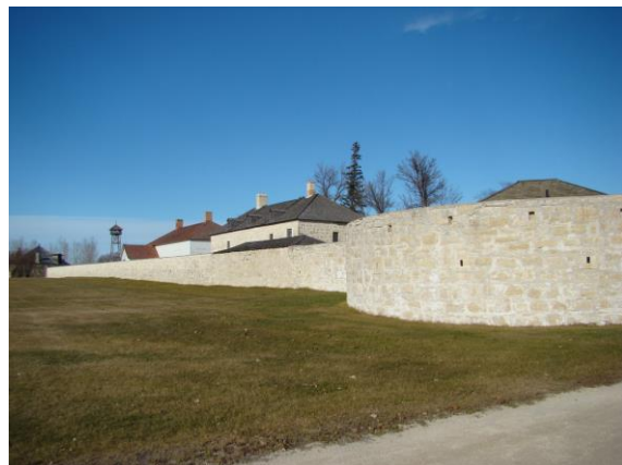
Lower Fort Garry