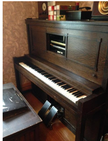
1919 Sherlock Manning pumper