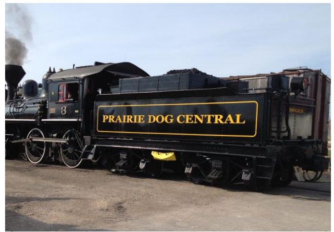
Prarie Dog Central No. 3